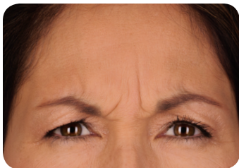
After (at day 7)