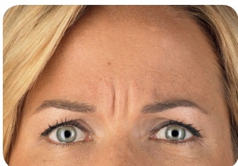
After (at day 7)